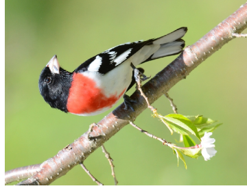
Rose Breasted Grosbeak

programs including guest speakers at member meetings, field trips and events, Capital Region education programs and conservation efforts, and more. We urge you to buy as much seed as you need for the entire winter.