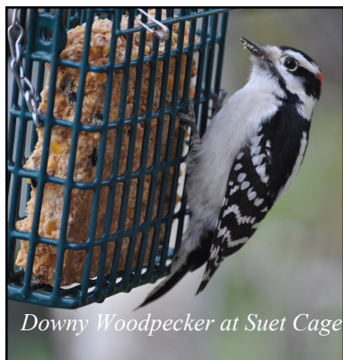
Downy Woodpecker at Suet Cage