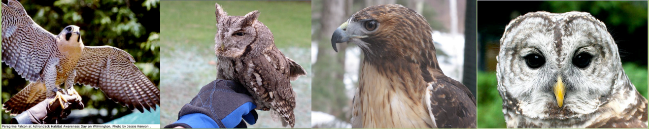
Peregrine Falcon at Adirondack Habitat Awareness Day in Wilmington.