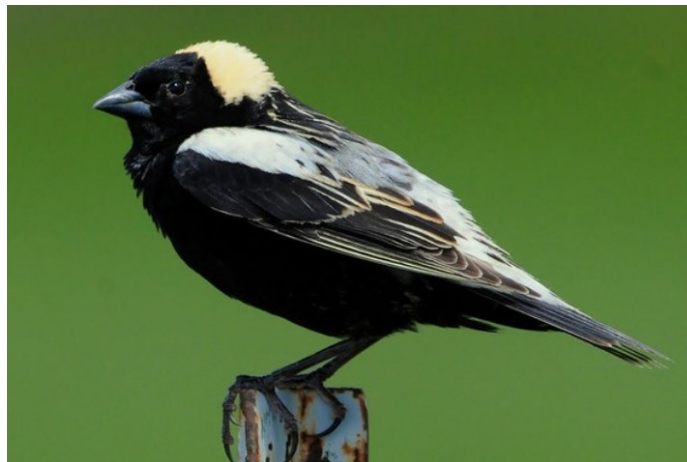
Bobolink ( Dolichonyx oryzivorus ), NYS Management Concern

In the Northeast the number of grassland birds, such as the Bobolink seen below, has declined drastically in the last thirty years because of habitat loss. For example, the Eastern Meadowlark and Upland Sandpiper have declined by 85 to 90 percent in the last 30 years.