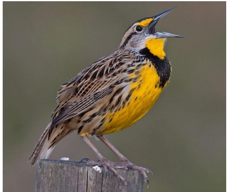
Eastern Meadowlark ( Sturnella magna ), NYS Management Concern

Here is a short list of organizations with grassland bird habitat programs, information, and interests: